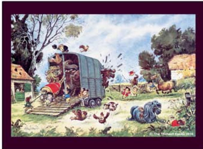
Style #002 The Horse Box

Brought to you exclusively by InkStables LLC