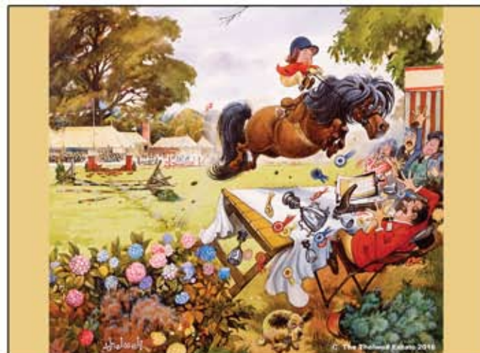
Style #005 Up For The Cup