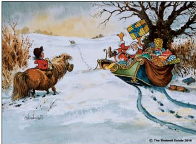
Style #001 Santa