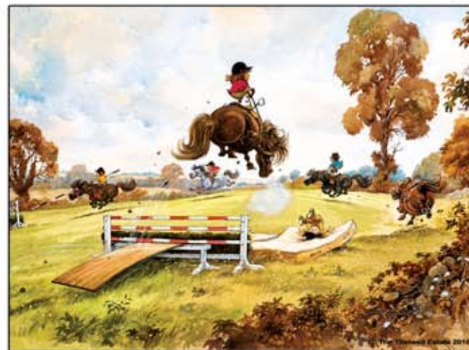
Style #004 Spring Feeling